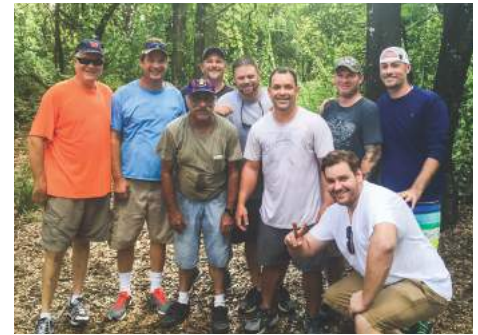
Team Peanut Butter